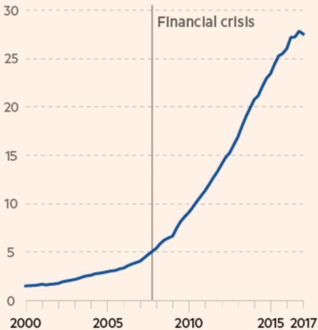
Debt in trillion US dollars